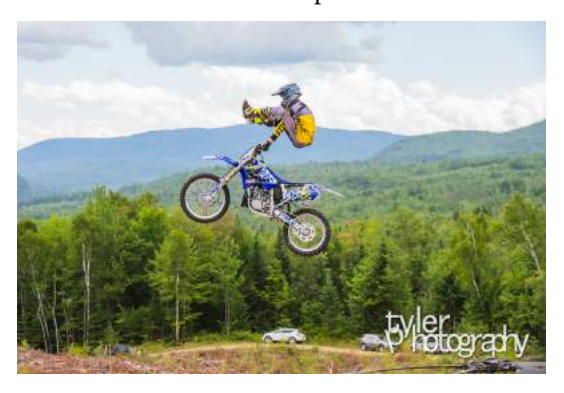
Jericho Mountain State Park is the Southern Portal to "Ride the Wilds - 1,000 Miles of Interconnected OHRV Trails!